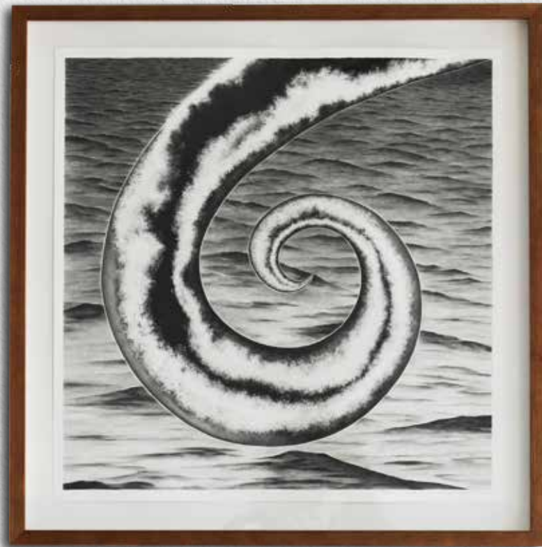
Future Romance (II) , 2017 Graphite drawing 55 x 53 cm (incl. frame) 13 200 SEK / € 1 270