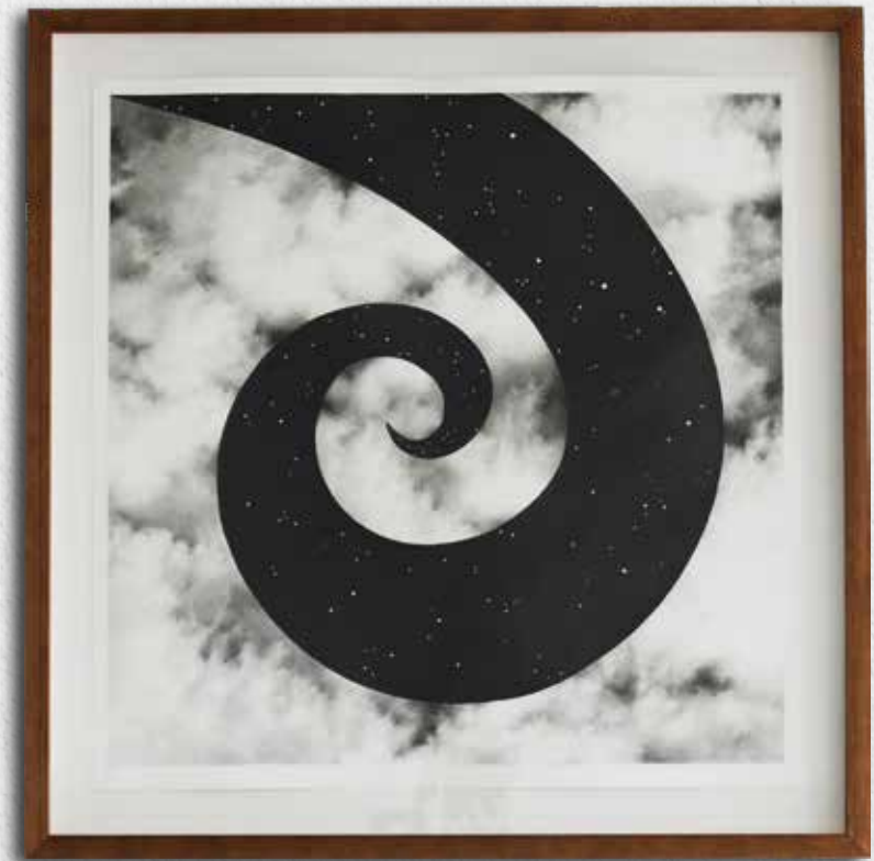
Future Romance (III) , 2017 Graphite drawing 55 x 53 cm (incl. frame) 13 200 SEK / € 1 270