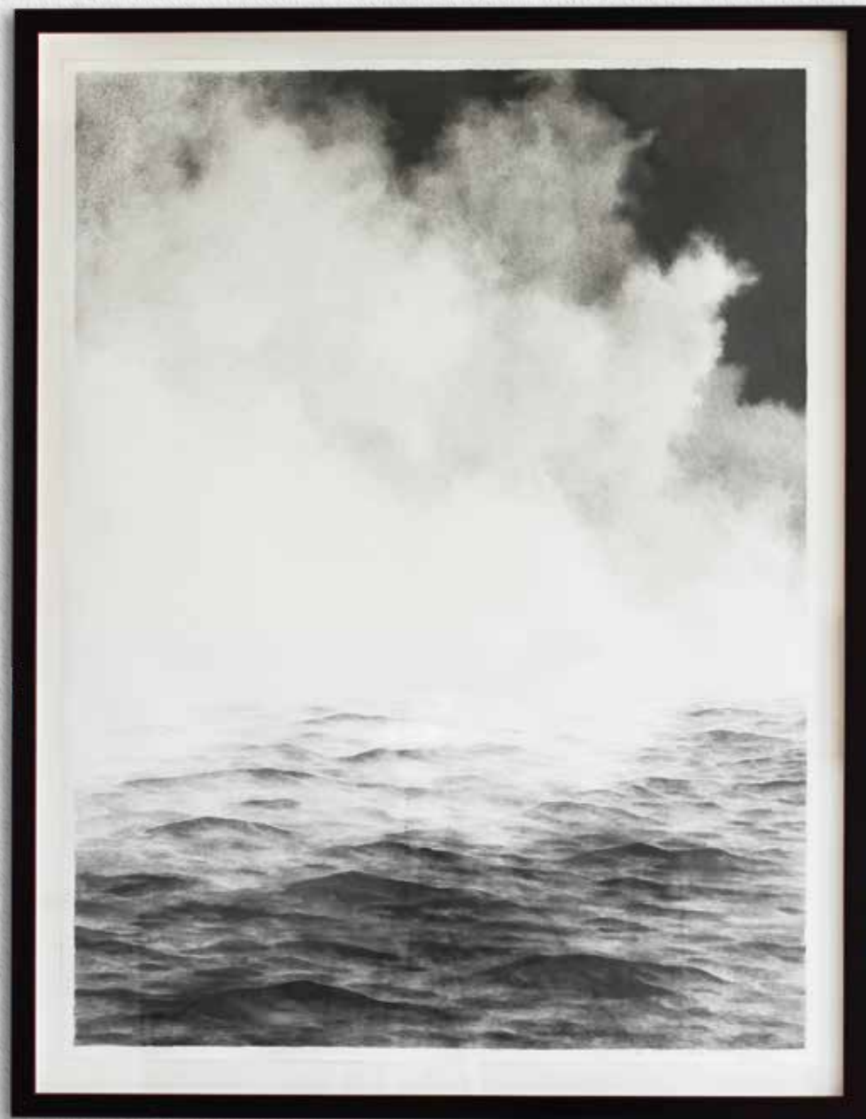
Horizon (III), 2019 Graphite drawing 89 x 67,5 cm (incl. frame) 32 000 SEK / €3 100