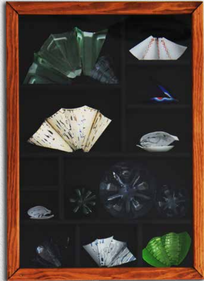
Treasures (II), 2017 Plastic waste 45 x 32,5 cm (incl. frame) 18 000 SEK / €1 800