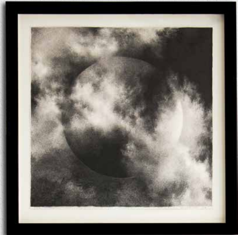
Future Romance (V), 2018 Graphite drawing 38,5 x 37,5 cm (incl. frame) 9 200 SEK / €880