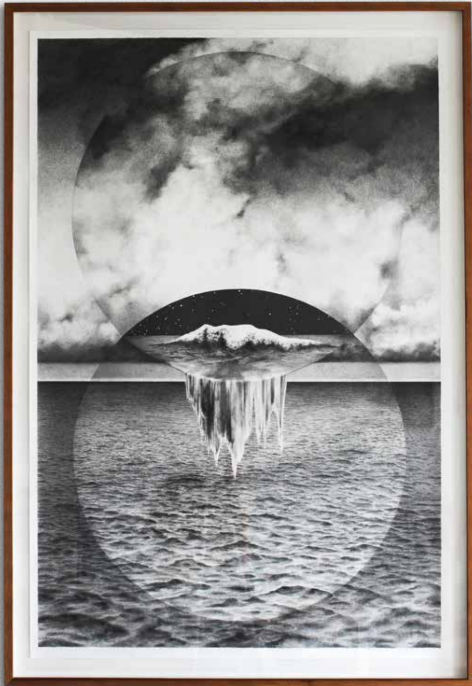
Future Romance (I) , 2017 Graphite drawing 118,5 x 80 cm (incl. frame) 48 000 SEK / €4 600