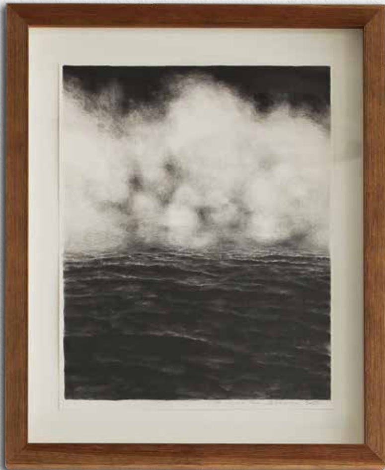
Horizon (I), 2017 Graphite drawing 31 x 25,5 cm (incl. frame) 5 200 SEK / €500