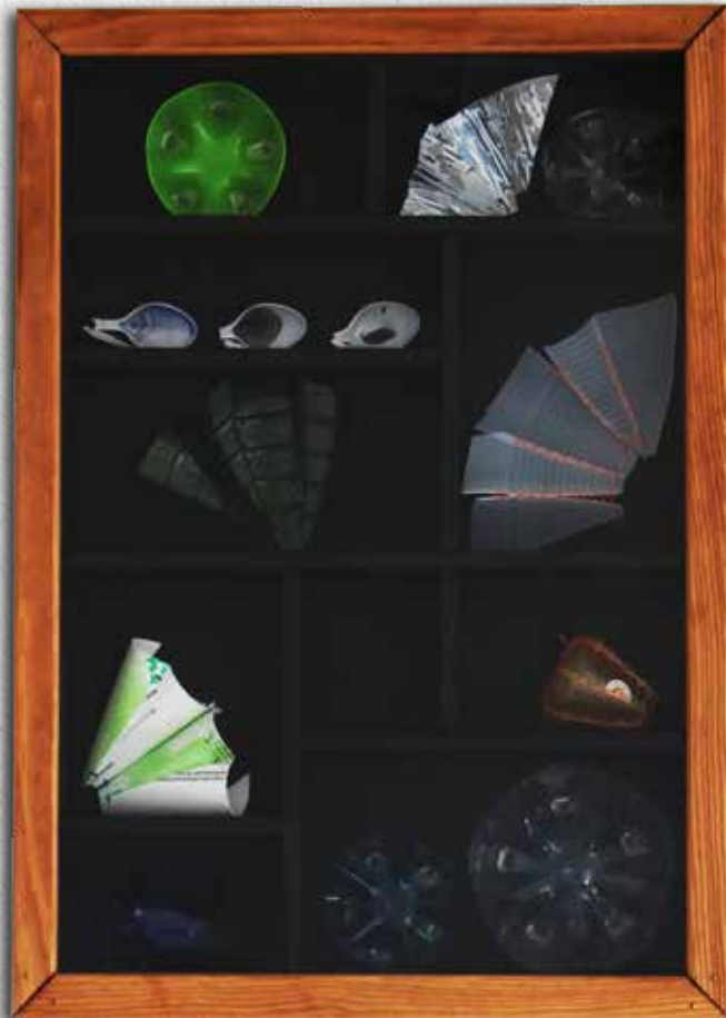
Treasures (I), 2017 Plastic waste 45 x 32,5 cm (incl. frame) 18 000 SEK / €1 800