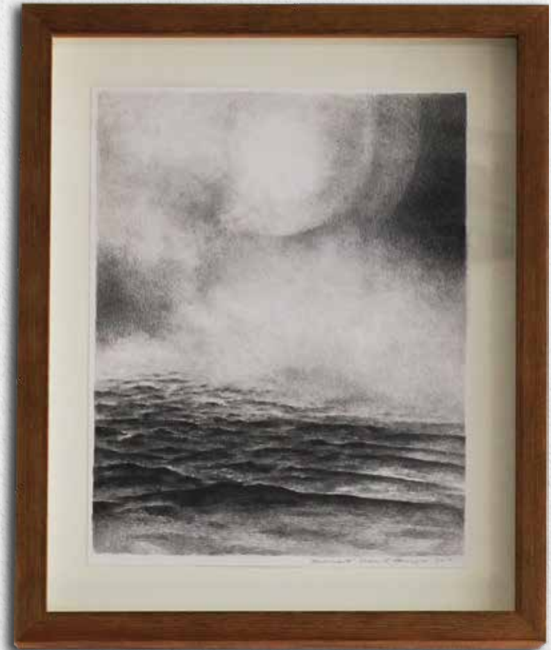
Horizon (II), 2019 Graphite drawing 31 x 25,5 cm (incl. frame) 5 200 SEK / €500