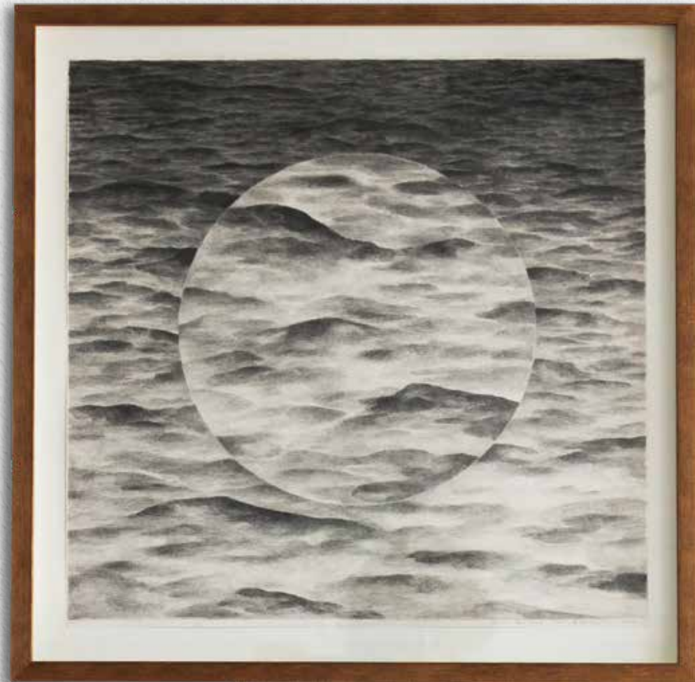
Future Romance (VI), 2019 Graphite drawing 50 x 49 cm (incl. frame) 11 200 SEK / €1 100