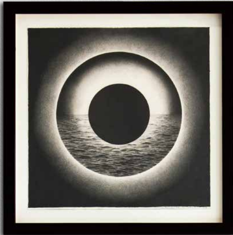
Future Romance (IV), 2018 Graphite drawing 38,5 x 37,5 cm (incl. frame) 9 200 SEK / €880