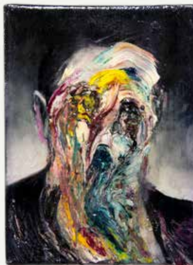
A Very Small Man, 2019