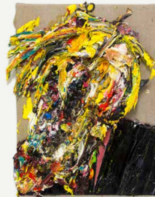
No Frills, 2019 Acrylic and oil on canvas 40 x 30 cm 12 500 SEK / €1 200