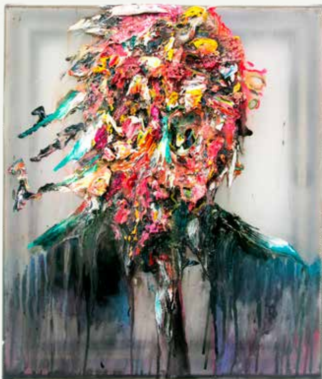
Portrait as a Politician, 2019 Acrylic and oil on silkscreen mesh 53 x 45 cm 15 500 SEK / €1 500