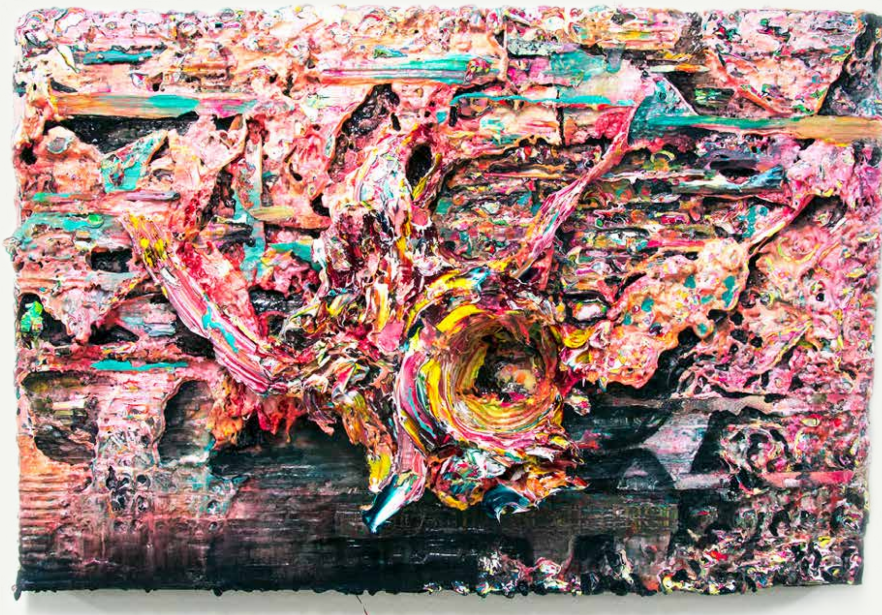
What Can You Tell Me?, 2020 Acrylic, silicone and oil on silkscreen mesh 76 x 52 cm 17 500 SEK / €1 700