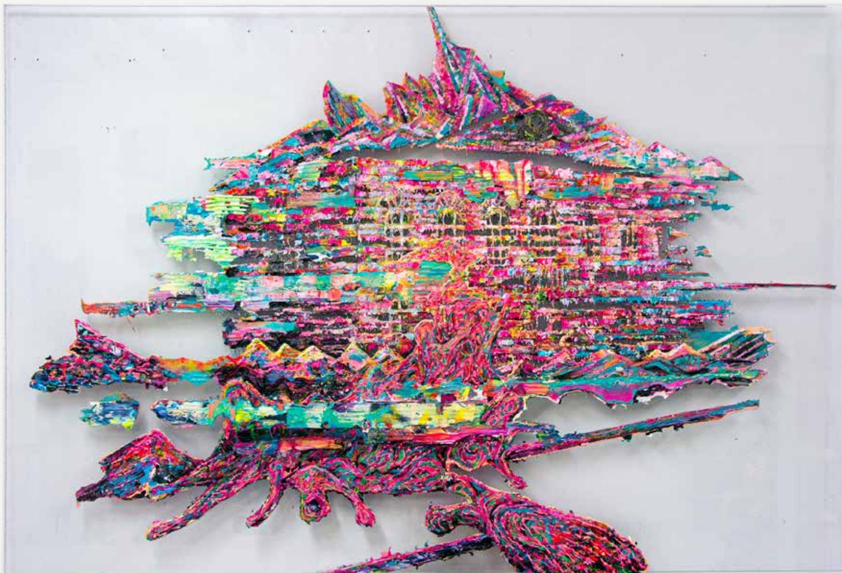
The Wreck, 2020 Acrylic and silicone on plexiglass 151 x 102 cm 25 000 SEK / €2 350