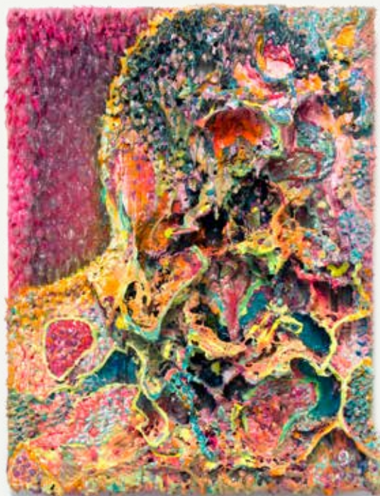
Let Them Eat Chips, 2019