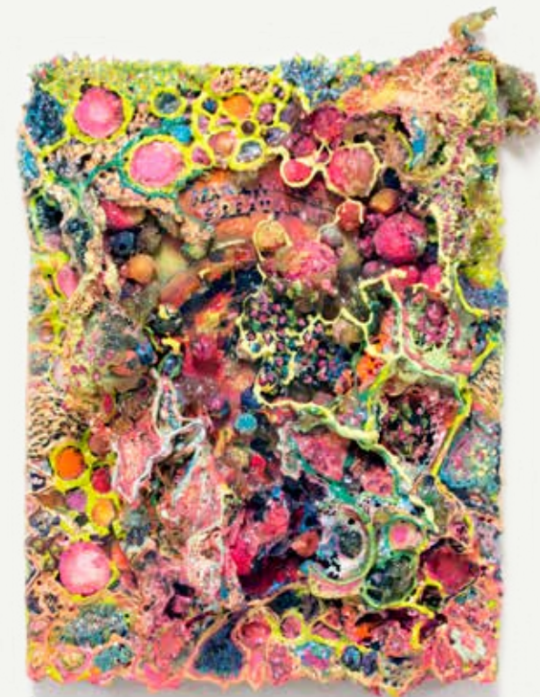
Make America Great Again I, 2019