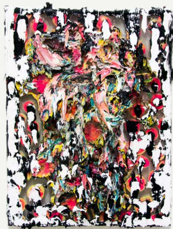
Jón Sigurðsson, 2019 Acrylic and oil on glass 41 x 31 cm 11 500 SEK / €1 100