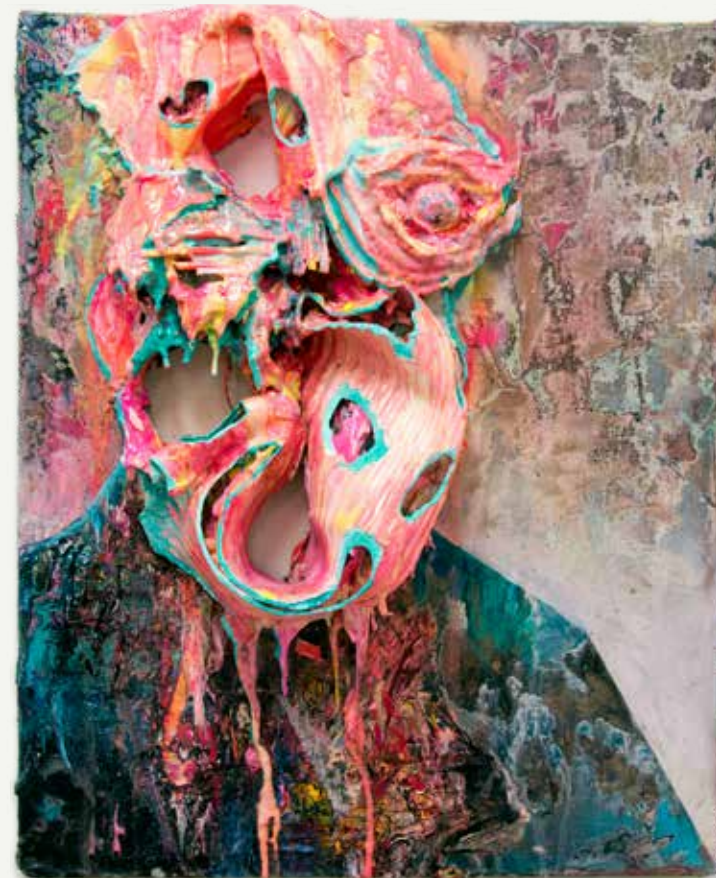
The Protestor II, 2020

Acrylic and silicone on canvas mounted on masonite