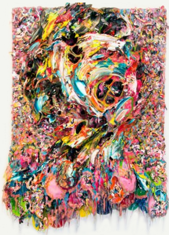
Birthday Boy, 2019

Acrylic, oil, balloons and glue on plastic