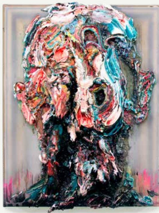
Collusion, 2019 Acrylic and oil on silkscreen mesh 53 x 41 cm 15 500 SEK / €1 500