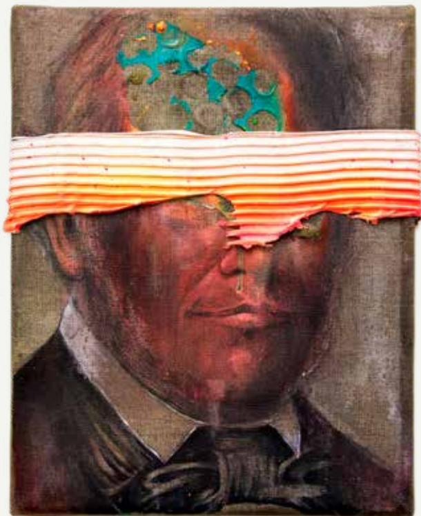
The Protestor I, 2020