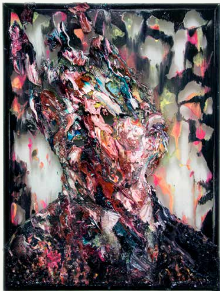
Reaganomics, 2019 Acrylic and oil on glass 41 x 31 cm 11 500 SEK / €1 100