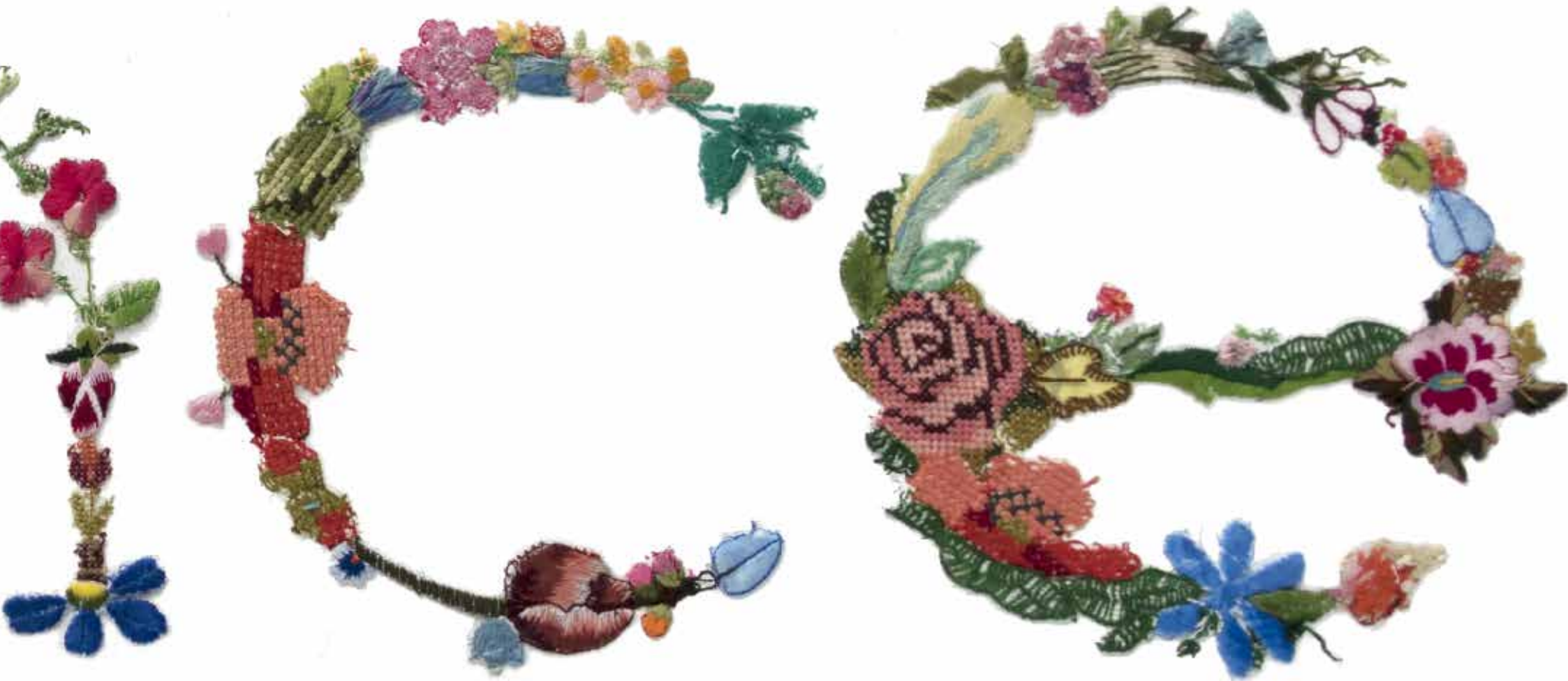
The Three Great Stimulants, 2019 (detail)