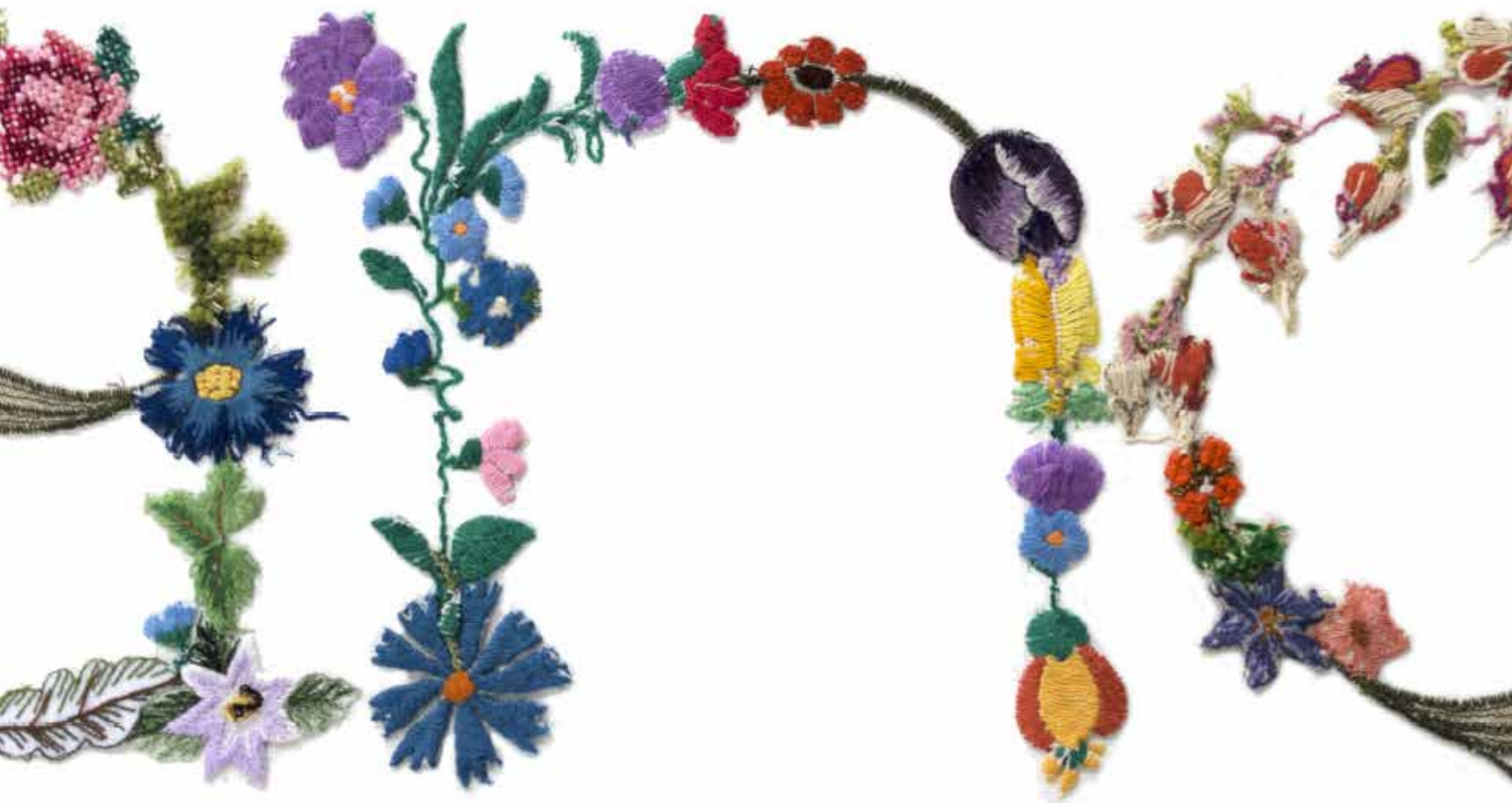
The Three Great Stimulants, 2019 (detail)