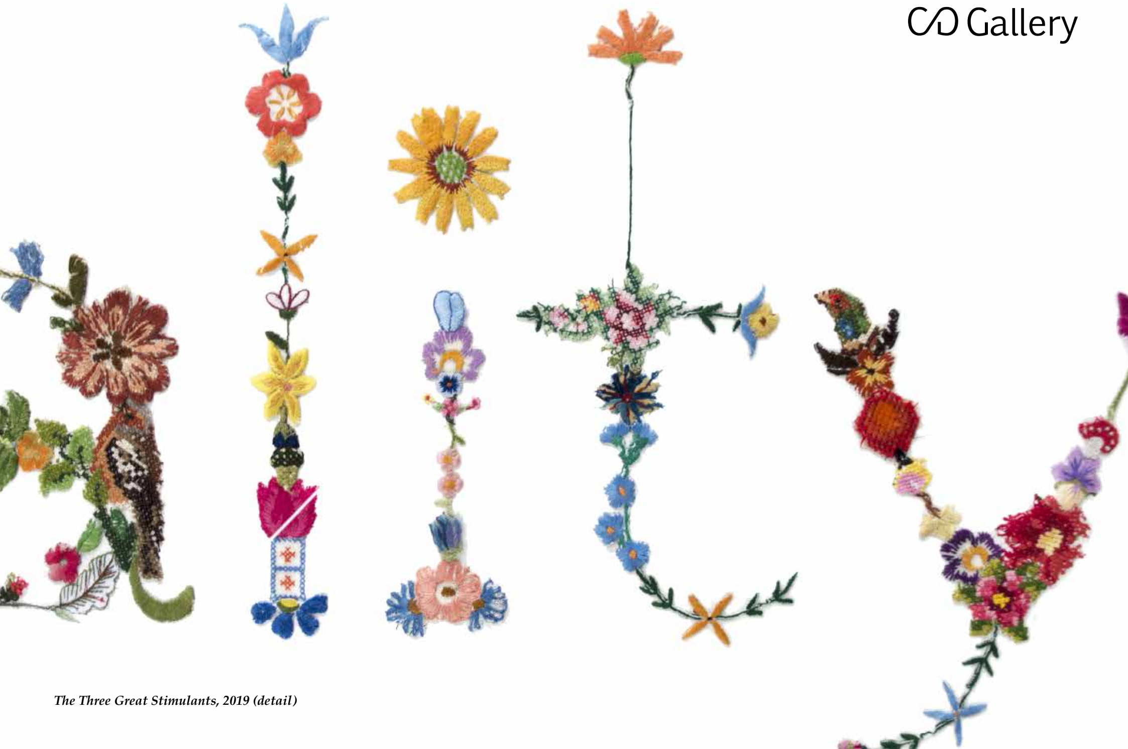
The Three Great Stimulants, 2019 (detail)